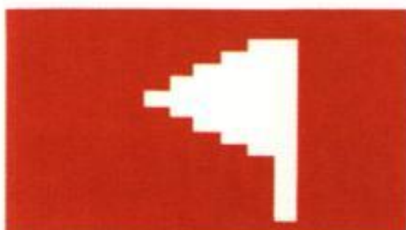
Wind Blowing to the Left

You must contend with a varying wind factor during each jump (except in Games 3 and 4). The "wind sock" at the bottom, center of the screen indicates the direction and the speed of the wind.